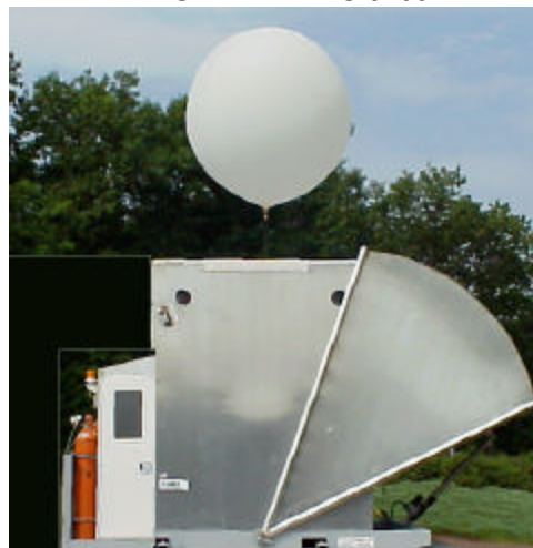
BILS-9004 Balloon Inflation and Launch Shelter (shown without optional air foils).

A steel base plate frame extends beyond the 14'L aluminum BILS inflation chamber, providing ample space for user-supplied helium gas tanks. In addition to providing tank storage, it adds mechanical rigidity to the system and permits flexible roof attachment. A fork lift can move the unit if necessary. At sites where the tank farm must be remote located for logistics, gas can be piped in. An adjustable helium gas regulator and solenoids control gas flow and a user-provided meter can log gas use.